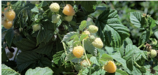
Primeberry ®(3) Autumn Sun ®(3)