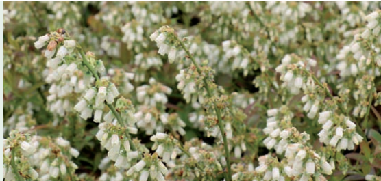
Little Blue Wonder ®(3)