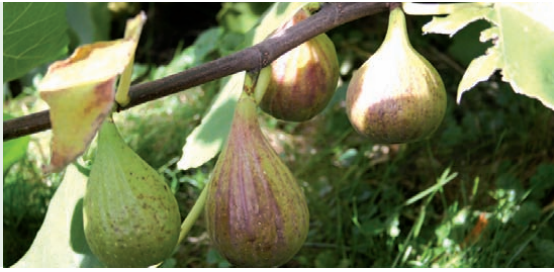
Gustissimo ®(3) Perretta ®(3)