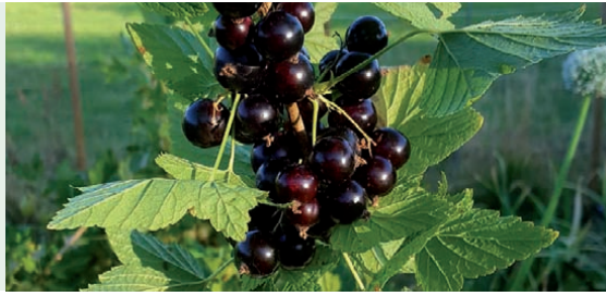
Cassissima ®(3) Black Marble ®(3)