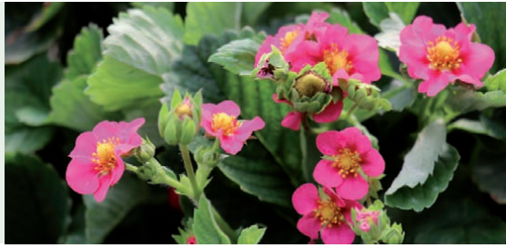
Double Pleasures ®(3) Pink Wonder ®(3)