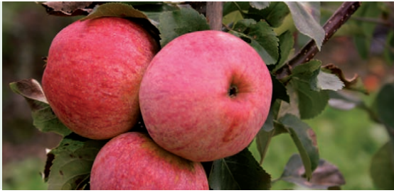
Maloni ®(3) Lilly ®(3)